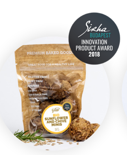
BIO SUNFLOWER AND CHIVE MINIS (6 pieces/pack)