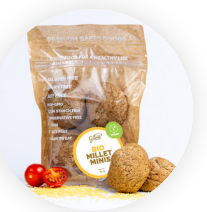
BIO MILLET MINIS (4 pieces/pack)