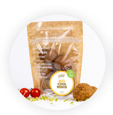
BIO CHIA MINIS (6 pieces/pack)