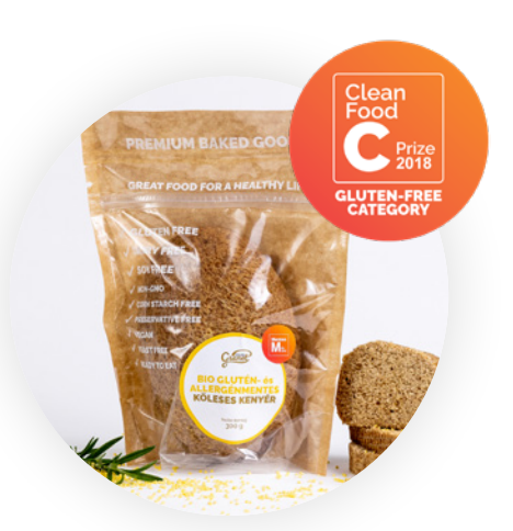
BIO MILLET BREAD