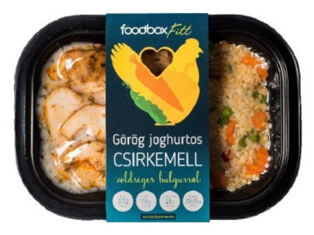
Greek yogurt chicken breast with vegetables bulgur

Low calory dishes for weight controlling consumers.