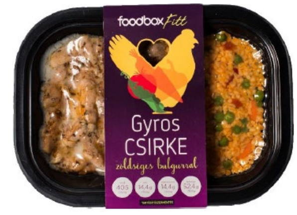
Gyros chicken with bulgur and vegetables