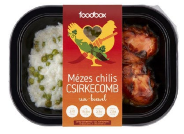
Honey chili chicken legs with rice and green peas