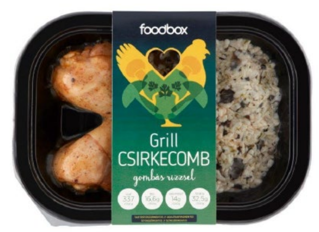
Grill chicken legs with mushroom rice