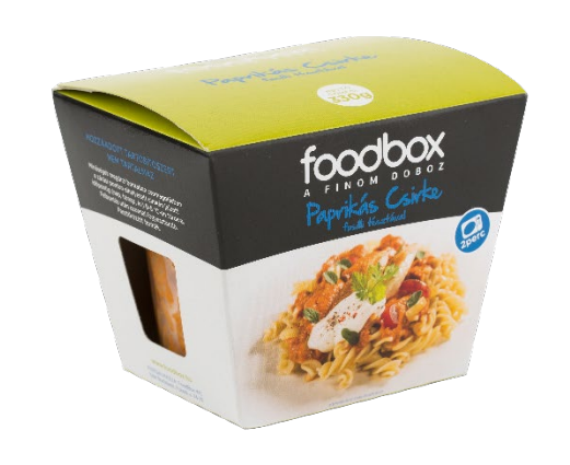
Chicken goulash with fusili