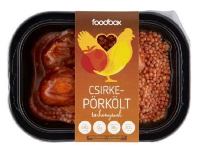
Chicken stew with egg barley