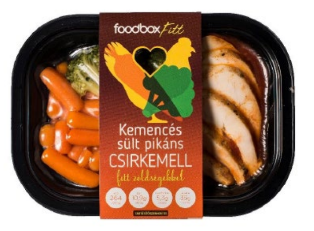
Oven baked spicy chicken breast with vegetables