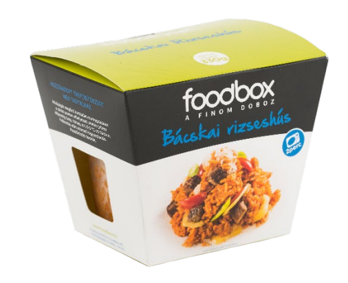
Rice and meat ,Bácska-art'