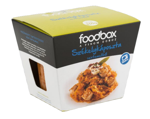
Hungarian Cabbage Stew a la "Székely"