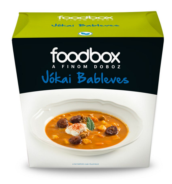
Jókai bean soup